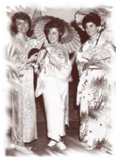
Three Little Maids