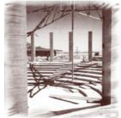
Cochise College under construction