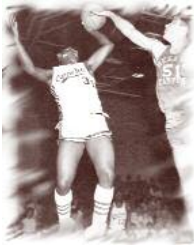
Apaches in action