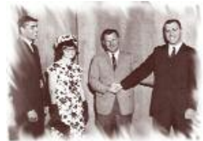
First three graduates