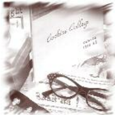
Cochise College's first catalog.