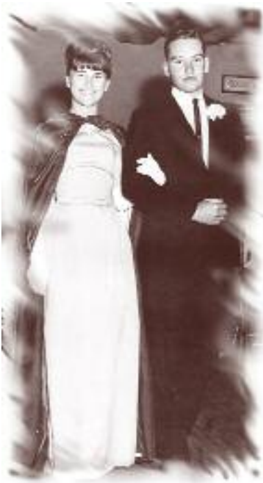
Red and White Ball