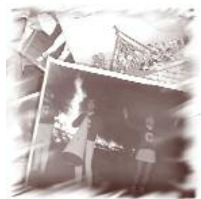
Bonfires were a ritual of College life