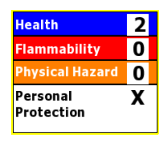
HMIS RATINGS (0-4)