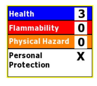
HMIS RATINGS (0-4)